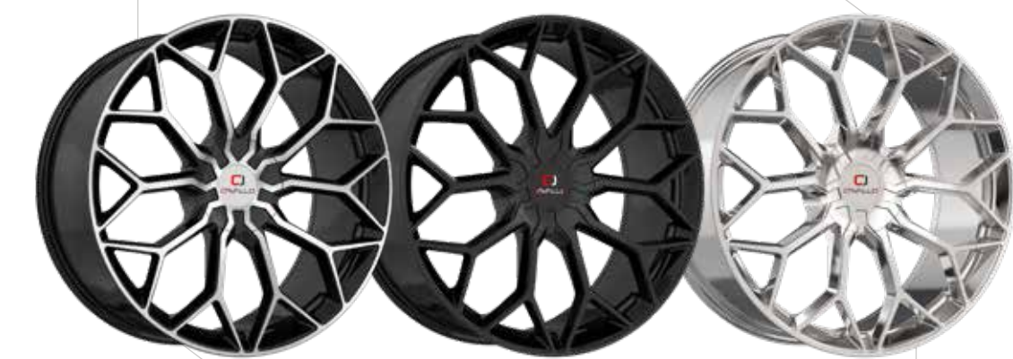
18" - 26"