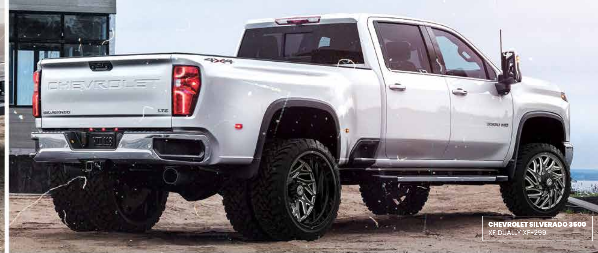
CHEVROLET SILVERADO 3500 XF DUALLY XF-299