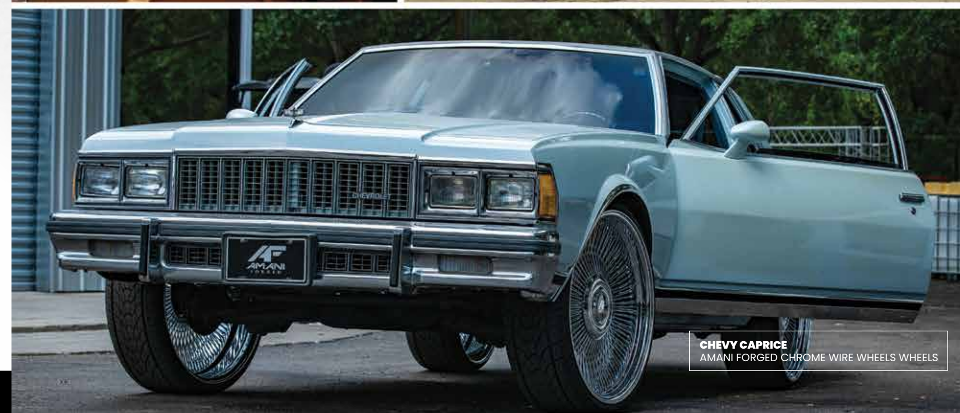
CHEVY CAPRICE AMANI FORGED CHROME WIRE WHEELS