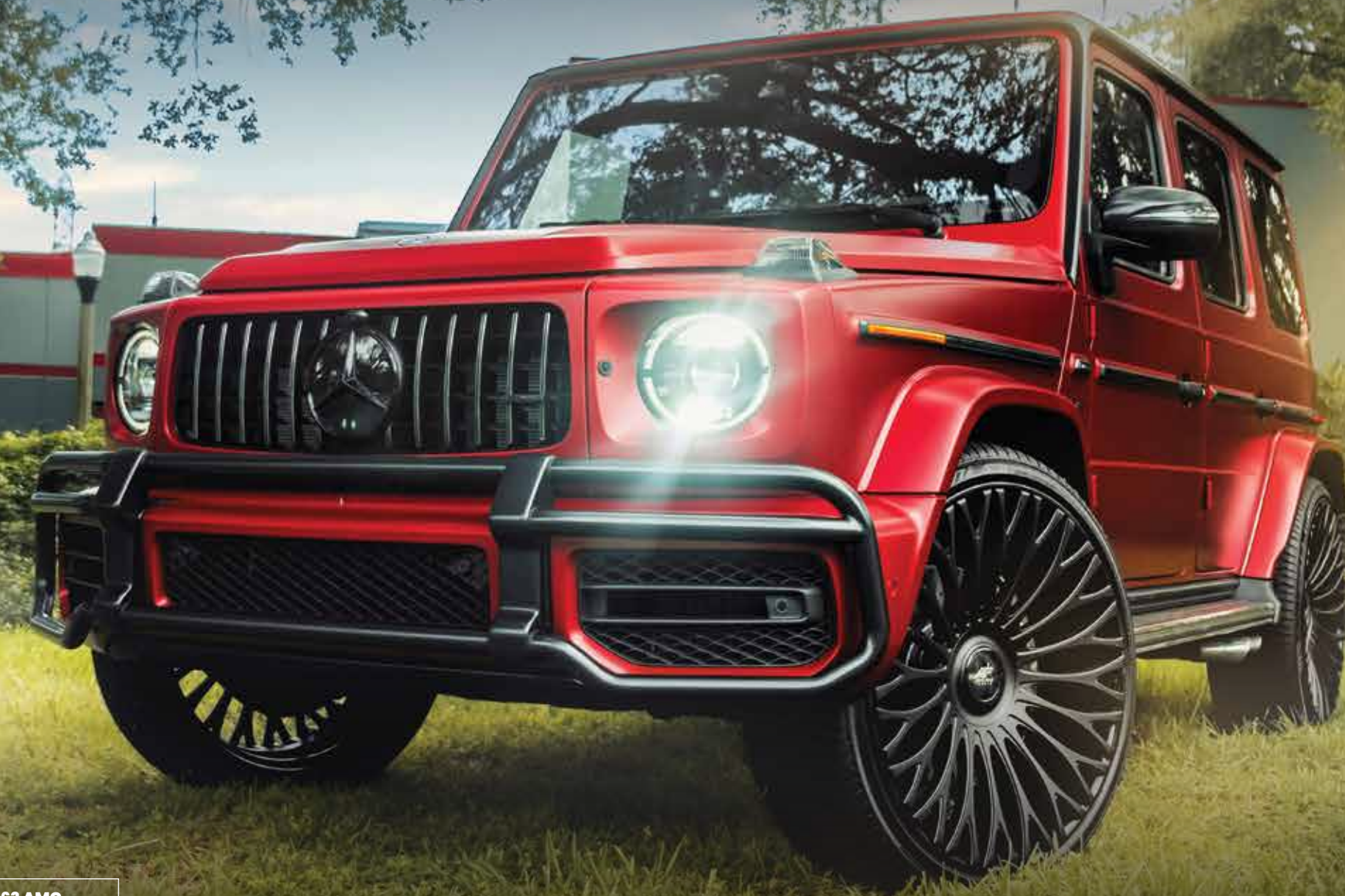
MERCEDES G63 AMG AMANI FORGED NAPOLIANO