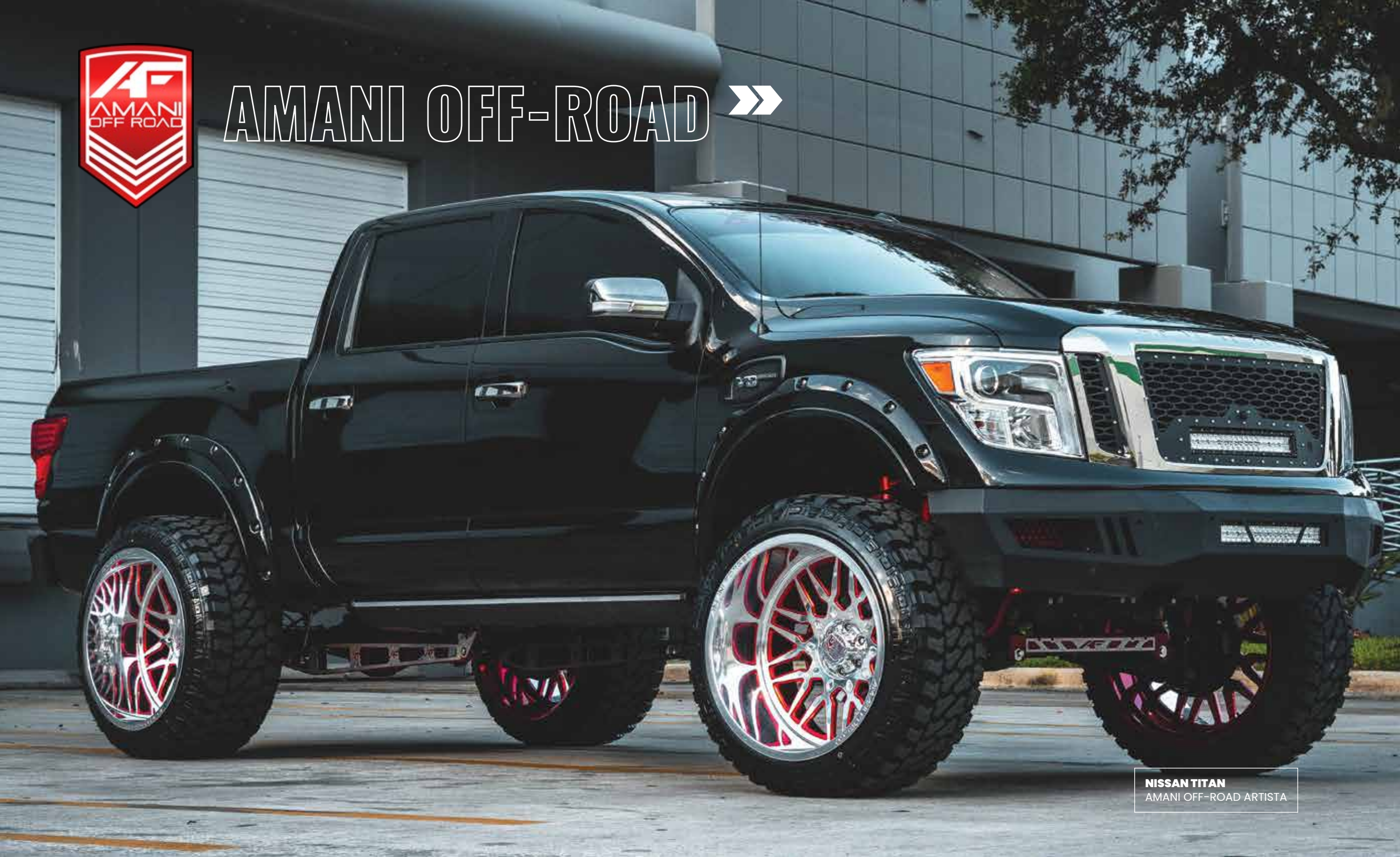
NISSAN TITAN AMANI OFF-ROAD ARTISTA