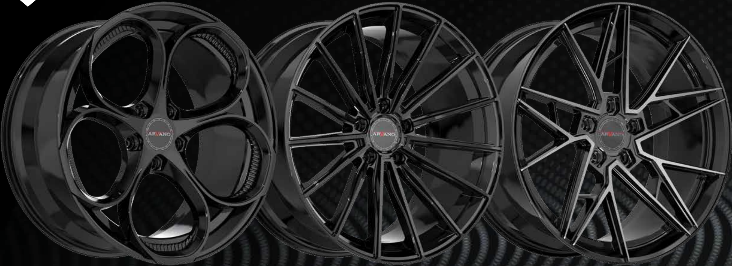
AV-58 20" - 24"