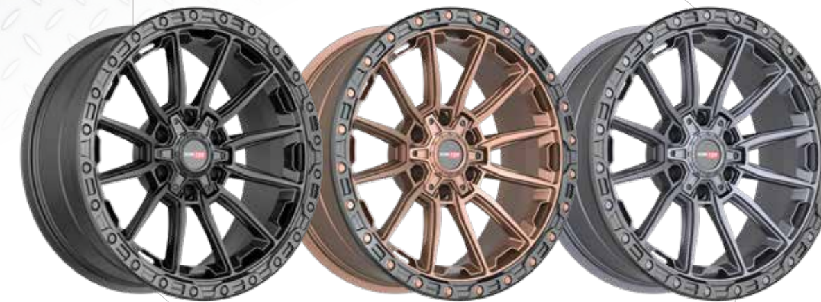
17" - 24"