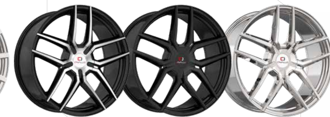
18" - 26"