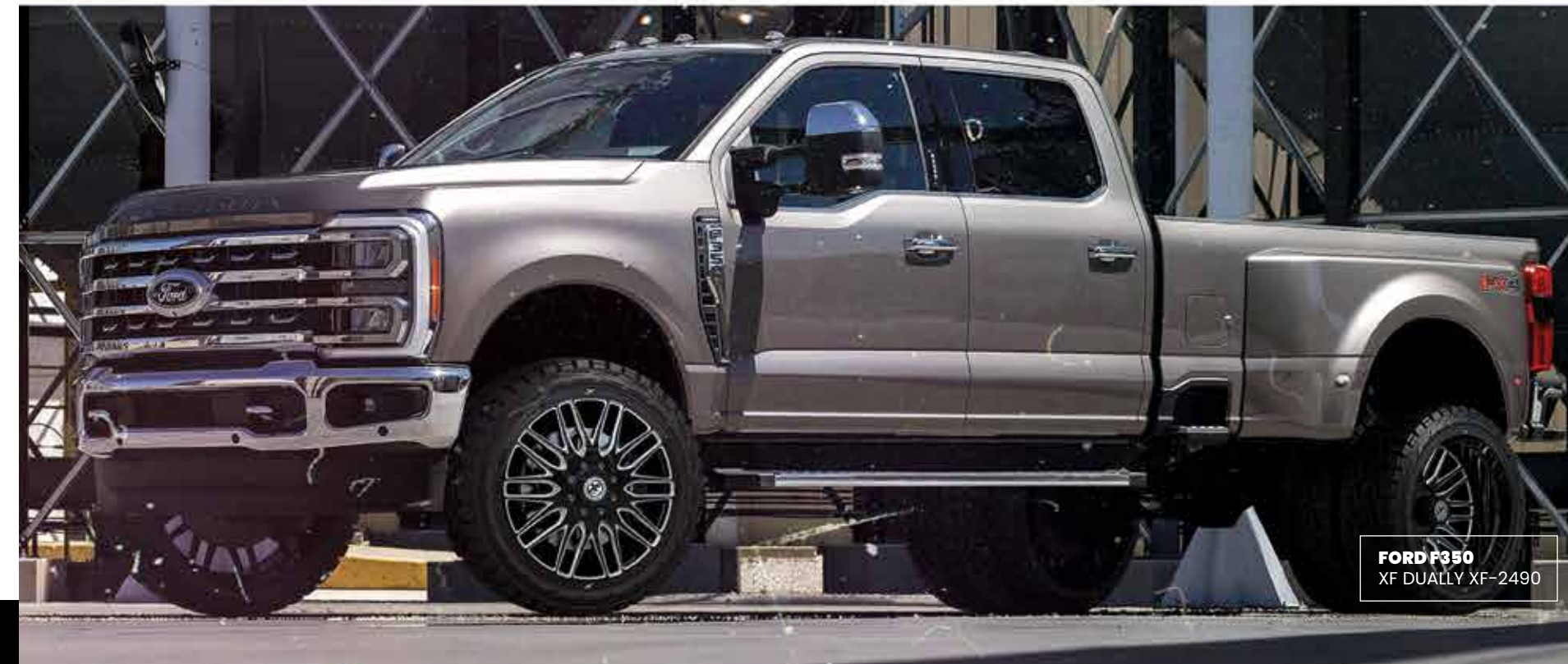
FORD F350 XF DUALLY XF-2490