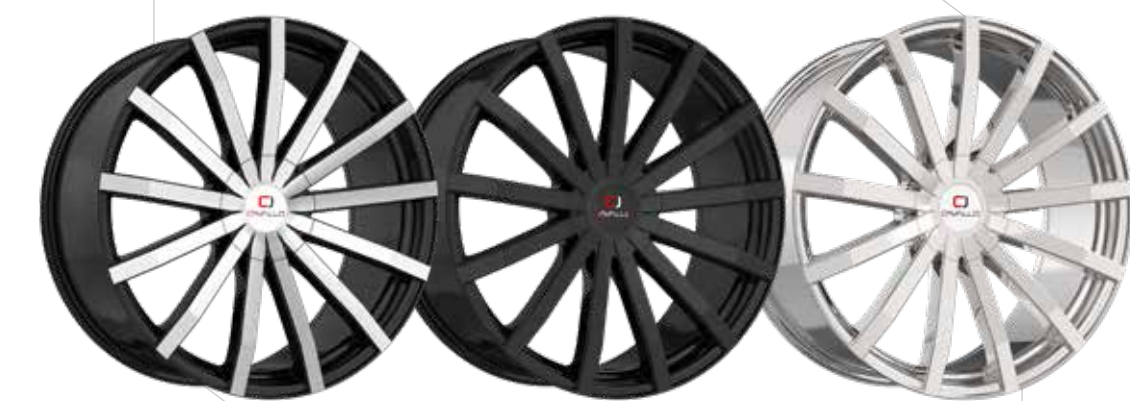
18" - 26"