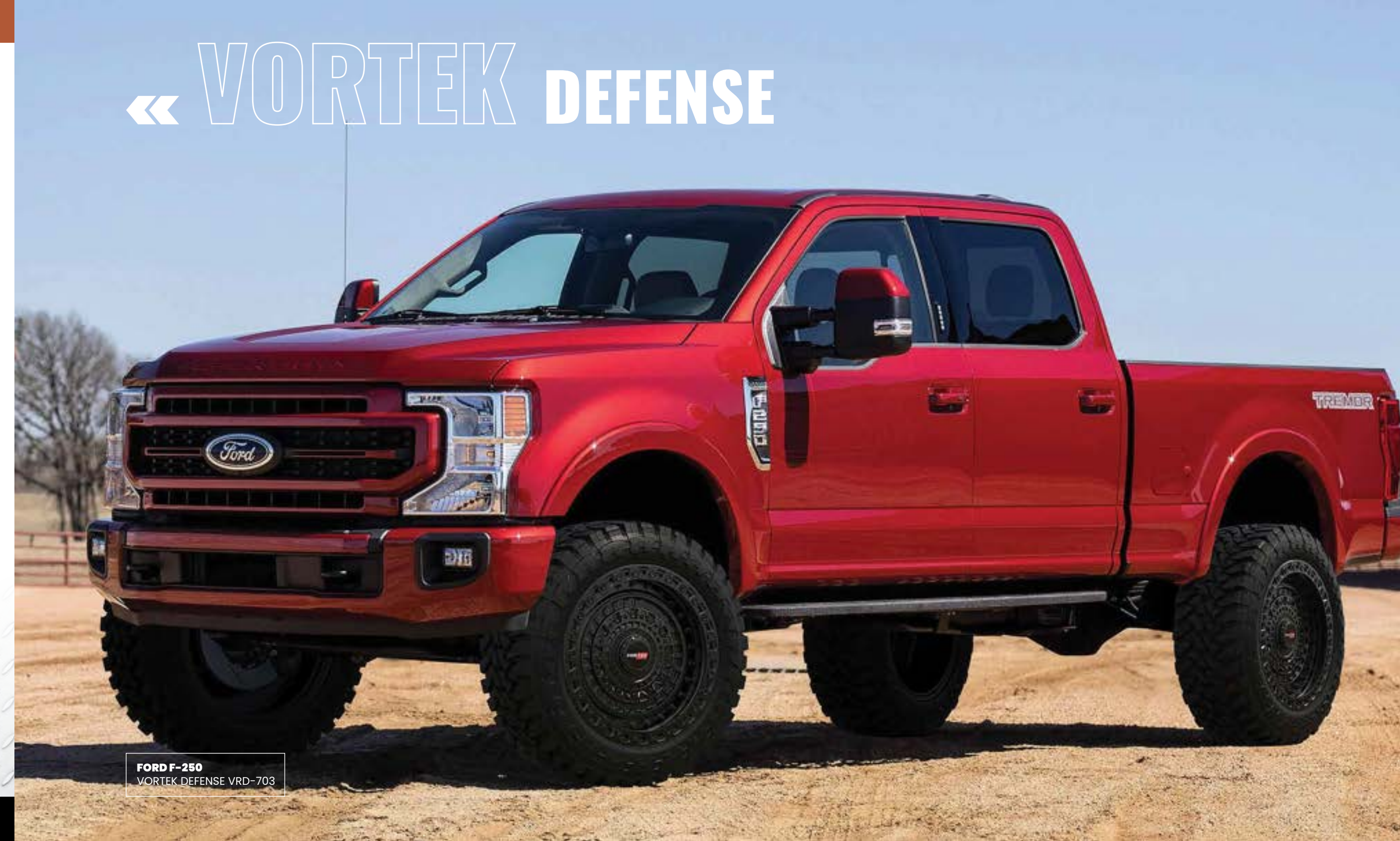
FORD F-250 VORTEK DEFENSE VRD-703