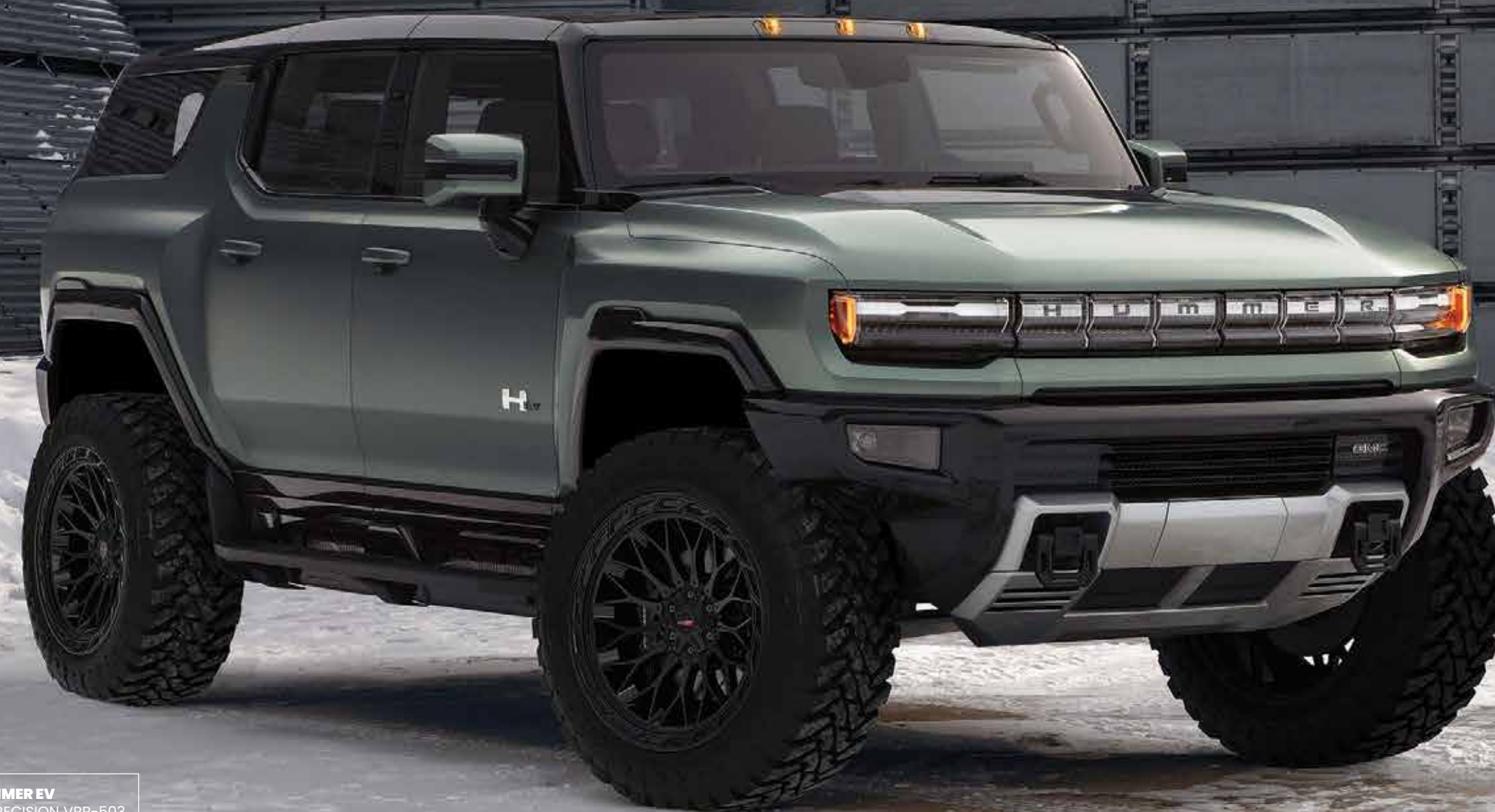
GMC HUMMER EV VORTEK PRECISION VRP-503