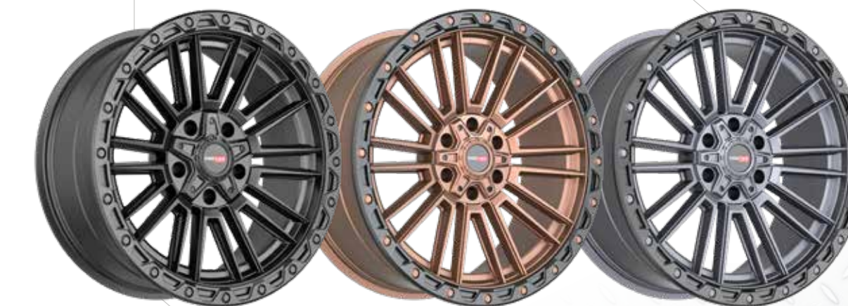
17" - 24"