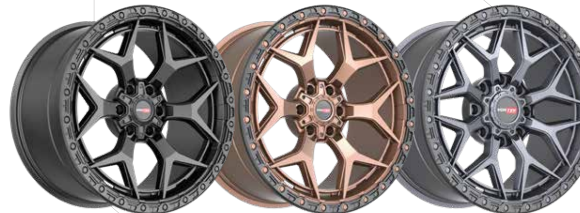
17" - 24"