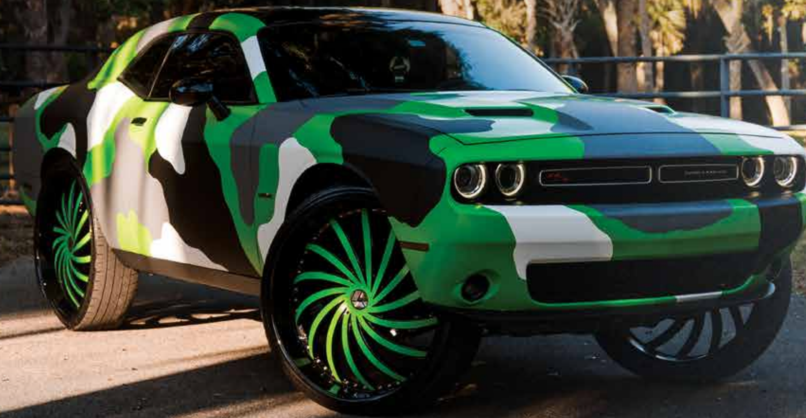
DODGE CHALLENGER AZARA AZA-508