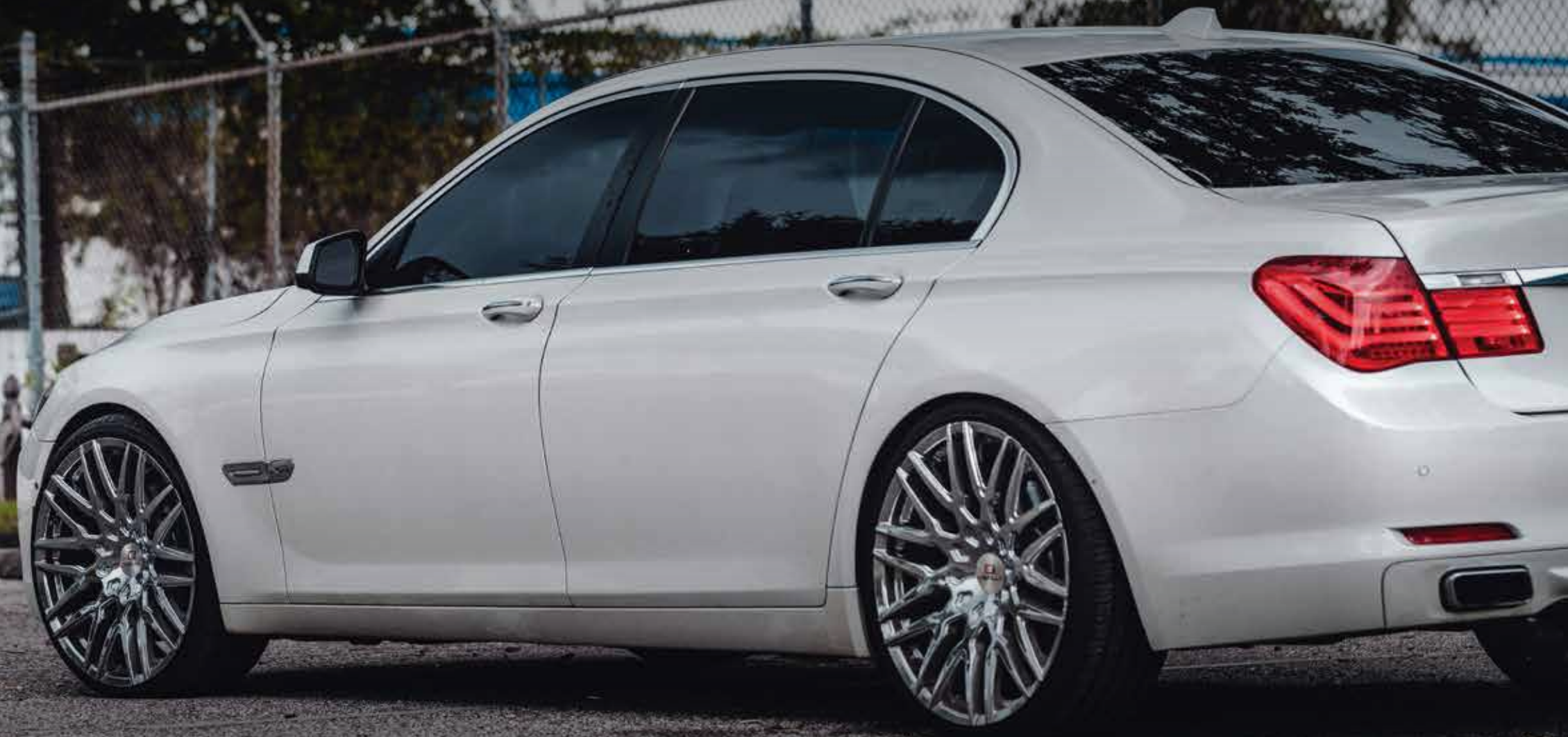
BMW 745i CAVALLO CLV-10