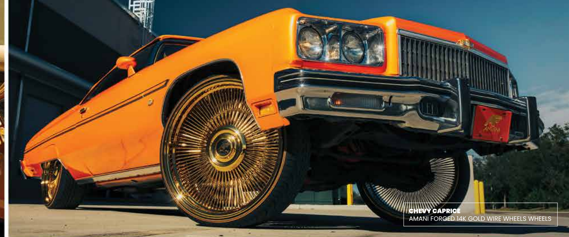
CHEVY CAPRICE AMANI FORGED 14K GOLD WIRE WHEELS