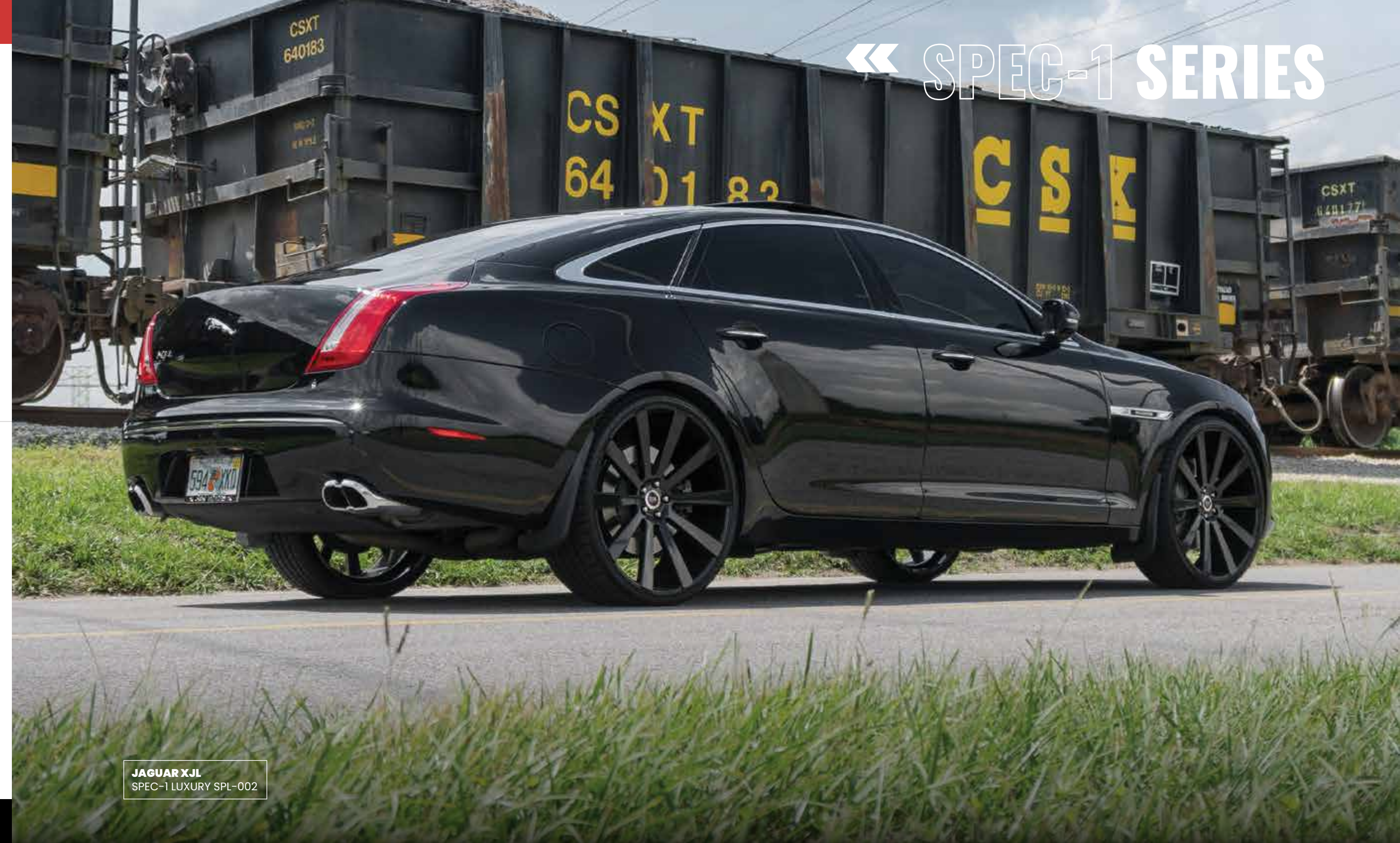
JAGUAR XJL SPEC-1 LUXURY SPL-002