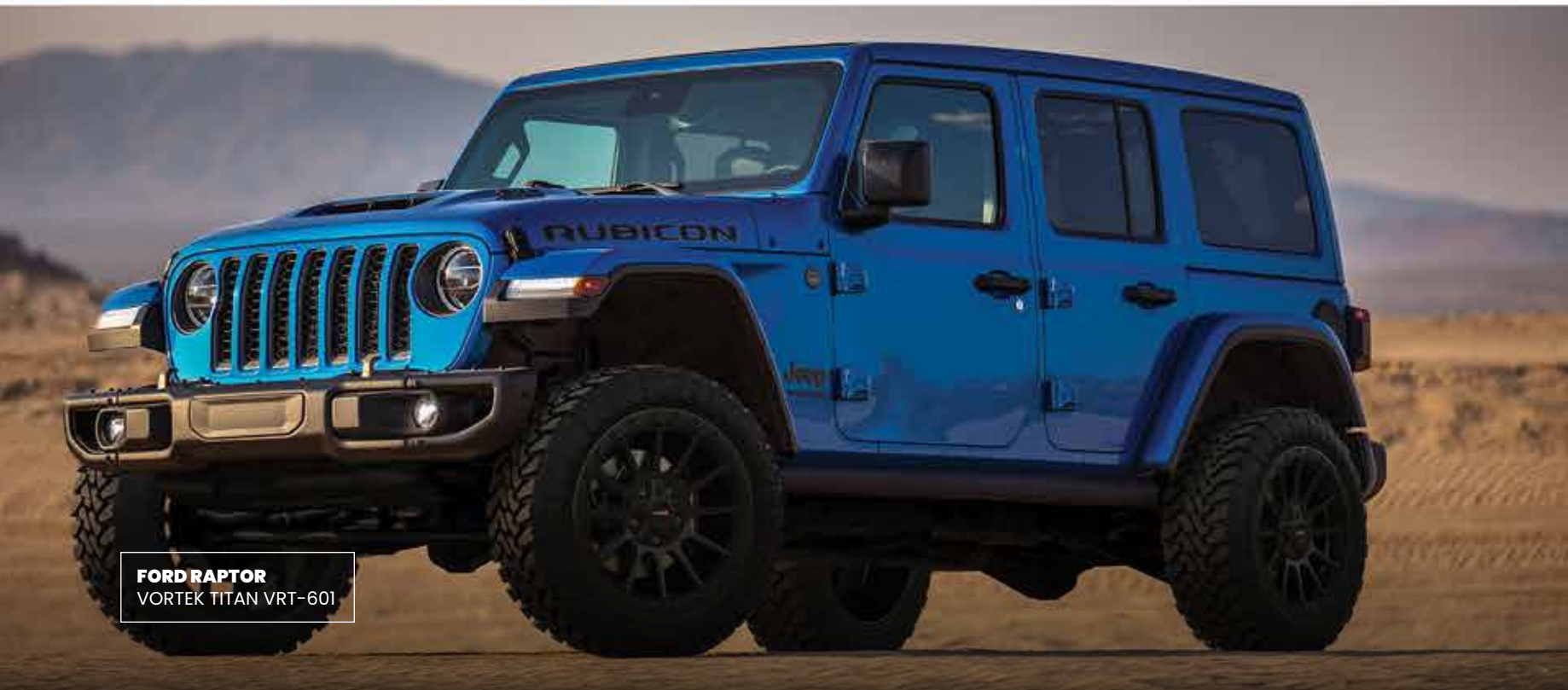
FORD RAPTOR VORTEK TITAN VRT-601