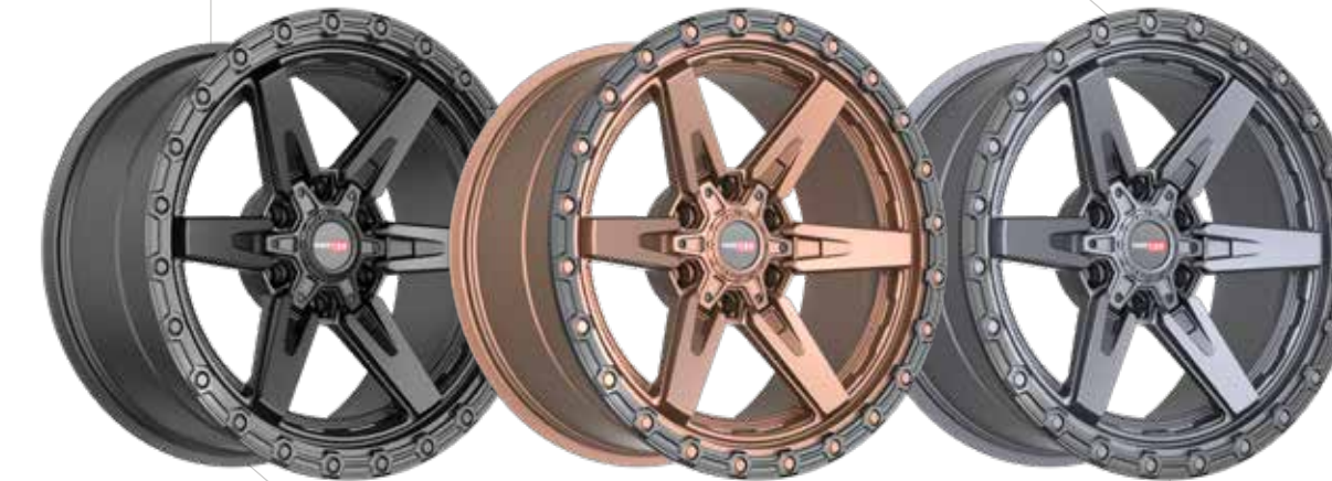
17" - 24"