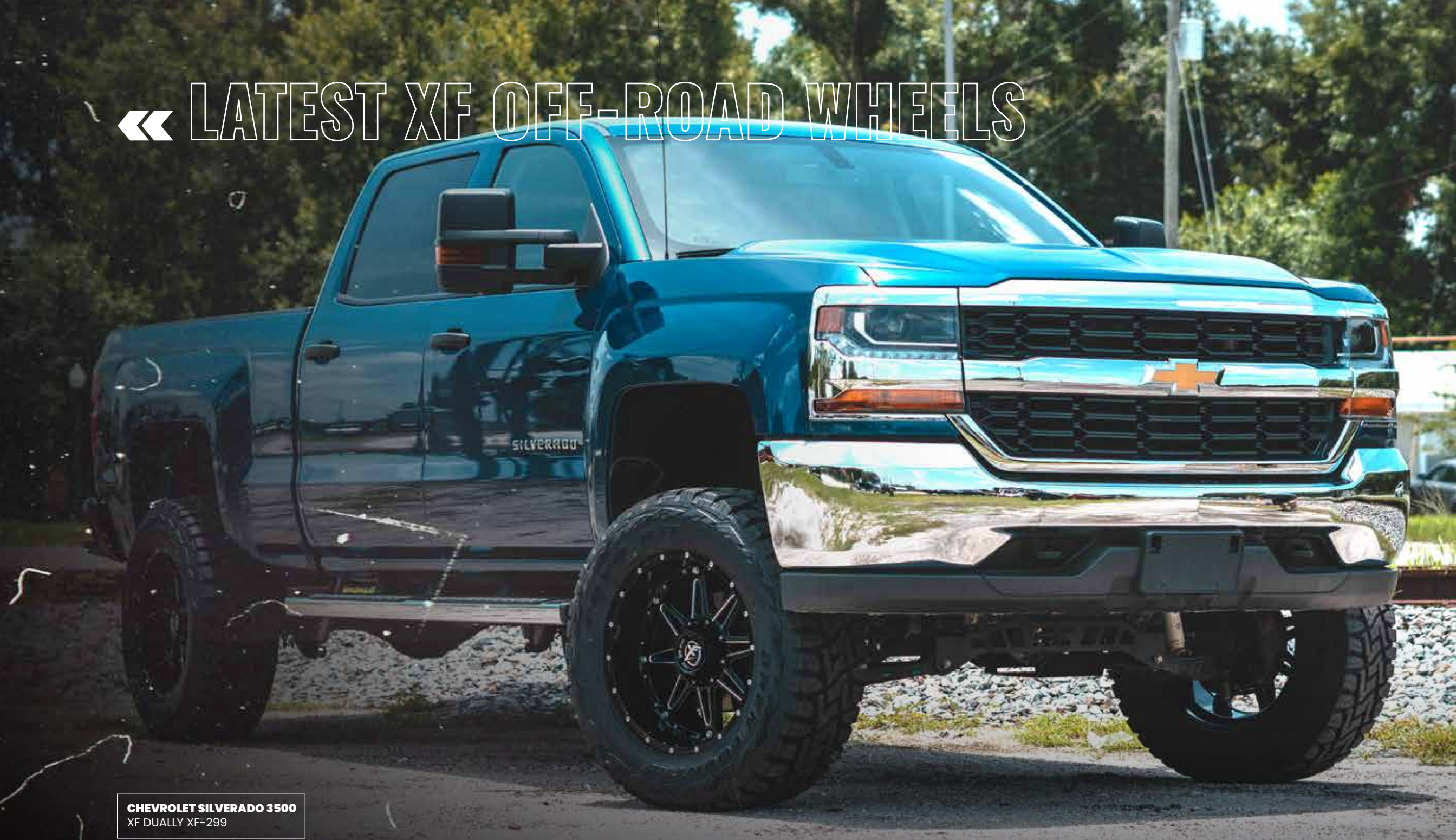
CHEVROLET SILVERADO 3500 XF DUALY XF-299